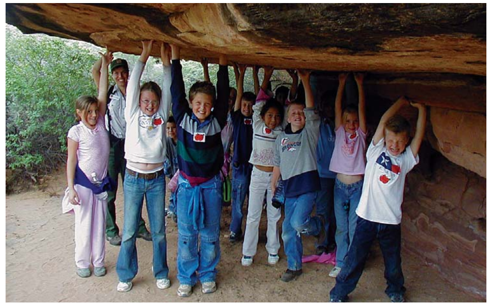
How many fourth graders does it take...? Blanding fourth graders enjoy the Needles District's Cave Spring Trail as they learn about cowboys, prehistoric rock art and plant adaptations.

A typical CCOE field trip is full of natural and cultural experiences. The fourth graders who visit Canyonlands hike the