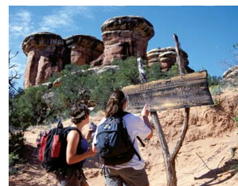
On the trail to Chesler Park