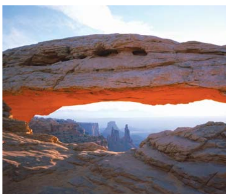
Sunrise at Mesa Arch