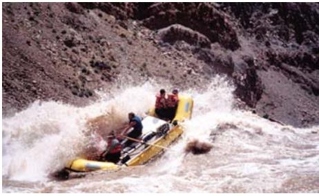
A raft plunges through a rapid on its way through Cataract Canyon.