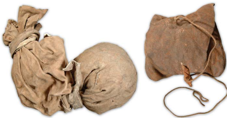
Above left: The bag shortly after recovery, with two pouches separated by a leather strap. Above right: One of several pouches found in the upper compartment.

While the particular species of marsh-elder in the bag has not been found in Canyonlands, it is available in surrounding areas. The scientists performed a number of experiments to try and determine how the seeds might have been used. Marsh-