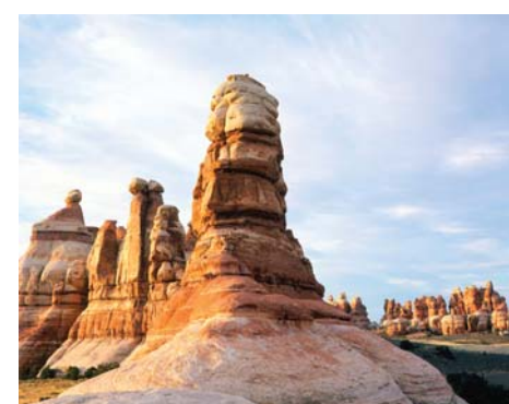
Rock spires in Chesler Park