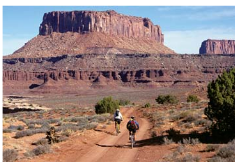
Mountain biking on the White Rim Road