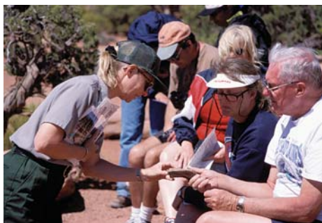
Interpretive program at Grand View Point

For more information on Canyon Country Outdoor Education, including internship opportunities and program curriculums, visit the "For Teachers" section of the park's website: www.nps.gov/cany .