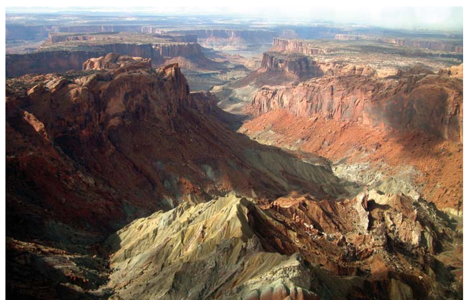
Impact crater or salt dome: an aerial view of Upheaval Dome looking toward the Green River.

Other scientists believe this feature has more in common with an impact crater than a salt dome. They estimate that roughly 60 million years ago, a meteorite roughly one-third of a mile wide slammed into the earth at what is now Upheaval Dome. The impact created a huge explosion, sending dust and debris high into the atmosphere. The impact initially created an unstable crater that partially