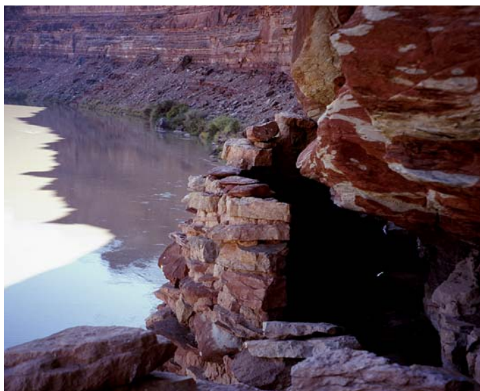
One of the many sites surveyed along the Colorado and Green rivers.

Condition information was also collected, describing site damage, identifying natural and human disturbances and evaluating the potential for future damage. Site condition was found to be quite