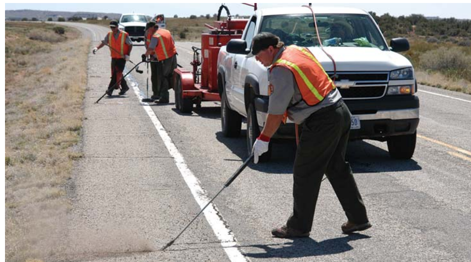
Preventative maintenance like crack sealing extends the life of park roads.

National Park Service employees and volunteers work hard to protect the resources of Canyonlands. Now you're a partner in this important work. Thanks to you, park facilities and programs are improving, and visitors can continue to experience this national treasure for generations to come.